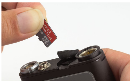
The audio is recorded on a micro SD card (HC type).

When the distance is extreme or using a wireless microphone is not practical, the PDR recorder can travel with your subject and capture professional quality audio, synchronized with timecode. It's tiny size is unobtrusive and easily placed in garments and costumes, and easy to conceal when used as a “plant” microphone to capture environmental or location sound.